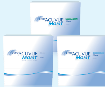
1-DAY ACUVUE® MOIST 1-DAY ACUVUE® MOIST for ASTIGMATISM 1-DAY ACUVUE® MOIST MULTIFOCAL