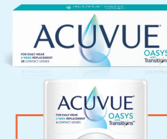
ACUVUE® OASYS with Transitions™