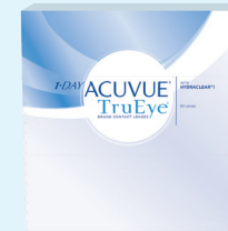
1-DAY ACUVUE® TruEye®