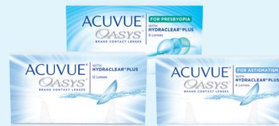
ACUVUE® OASYS with HYDRACLEAR® PLUS Technology ACUVUE® OASYS for ASTIGMATISM ACUVUE® OASYS for PRESBYOPIA