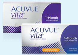
ACUVUE® VITA ACUVUE® VITA for ASTIGMATISM